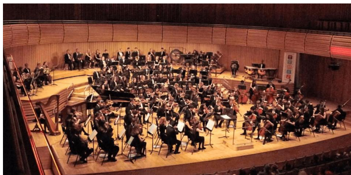
Watch out for a special edition of Notes in July as the Youth Orchestra return from New York.

The Music Hub Newsletter for Tees Valley.